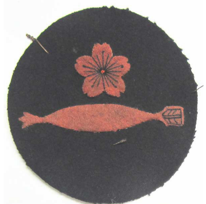
Badge with cherry blossom for a sailor

The mannequin on the right wears the uniform of a 1st sailor elite gunner (UNYO HO) with the Japanese imperial Navy . Note the characteristic leather apron, the bar for good conduct on the sleeve and the cherry blossom, the Japanese insignia rewarding exceptional conduct in a military function.